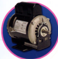
Motor Heavy Duty Instant Reversing Continuous Duty