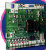
Diamond Control Board Easy to Use & State-of-the-art Advanced Features Come Standard Built-in Lightning & Surge Protection