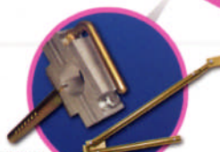
Quick-Release Swing Arm Simple & Secure No-Pinch Design for Added Safety